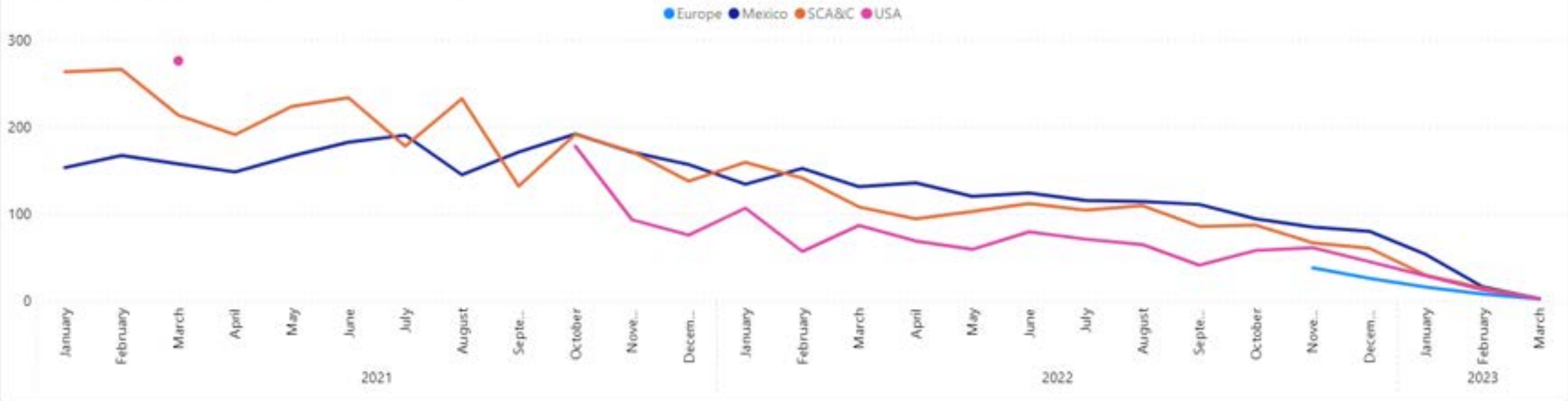
Cycle Time Avg by Requested Year, Requested Month and Region

00 01:00 Request 00 18:19 Request Approver 01 14:10 Vendor Log In 03 17:58 Vendor Submission